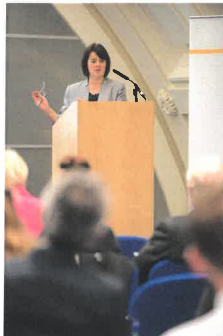
Jane Ellison MP, Parliamentary Under-Secretary of State for Public Health

She also confirmed she would be driving forward the Public Health Responsibility Deal. Under this scheme, companies sign voluntary pledges to, for example, cut the sugar and saturated fat contents of their products. This is intended to help consumers make informed diet choices and reduce rates of obesity, which is a key cause of type 2 diabetes.