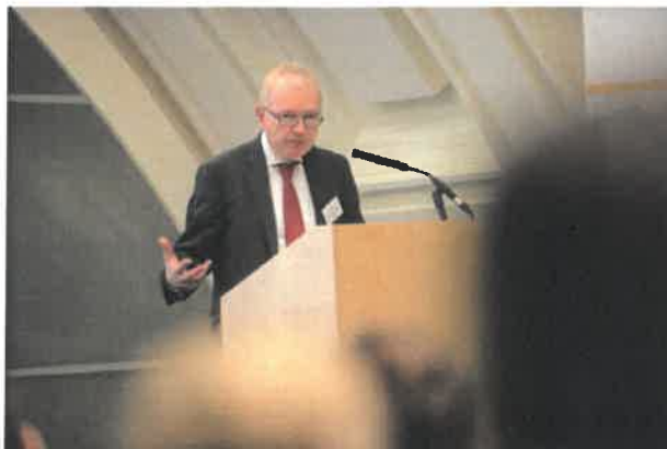
Lord Hunt of Kings Heath, Opposition Lords Health Spokesman